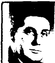
By Allen Rouse