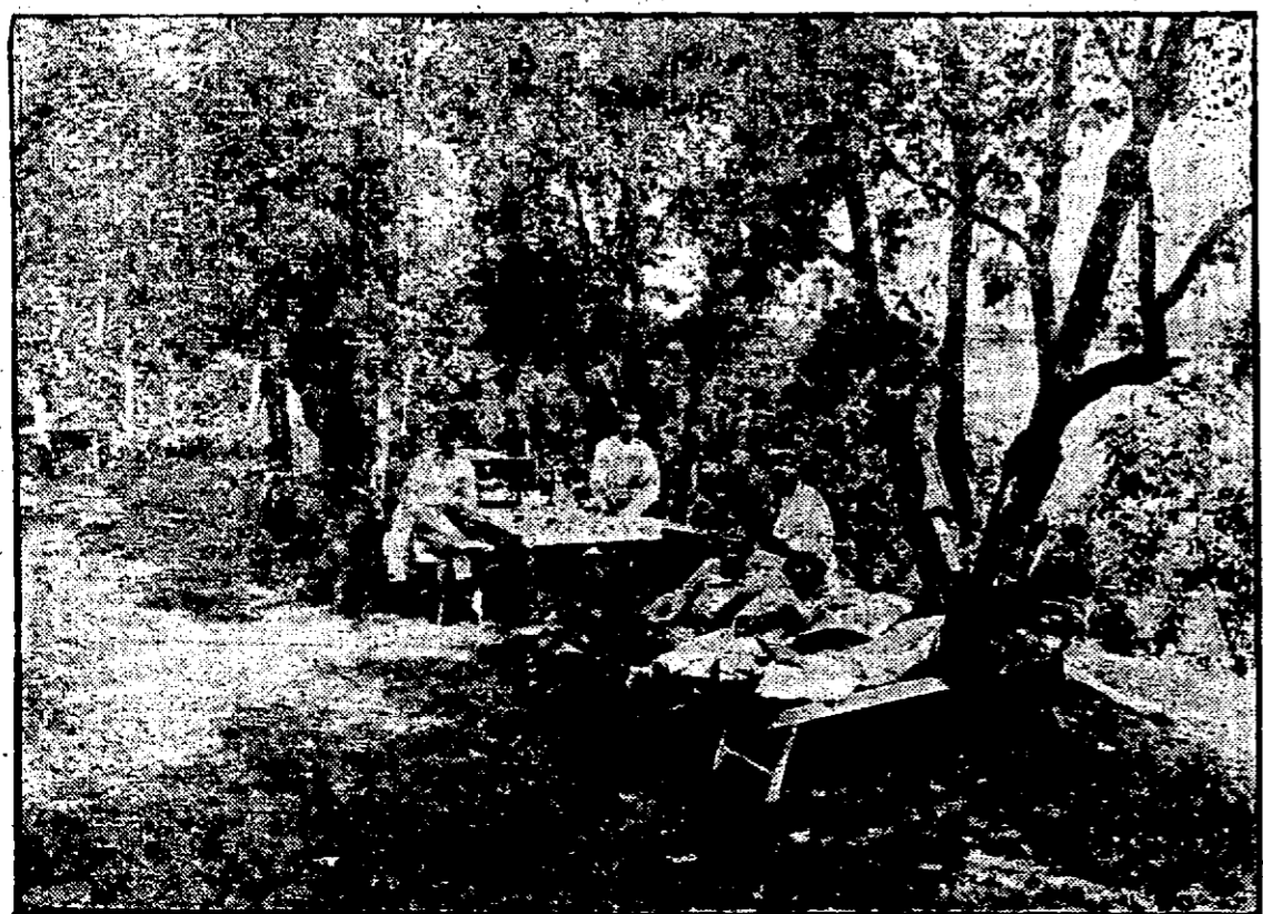
Summer Campers at Wildewood.

T HE new owners of the Nugent's Point Park site have laid out a choice portion of the property in a most attractive manner in LOTS RANGING FROM ONE ACRE UPWARDS , with river frontage.